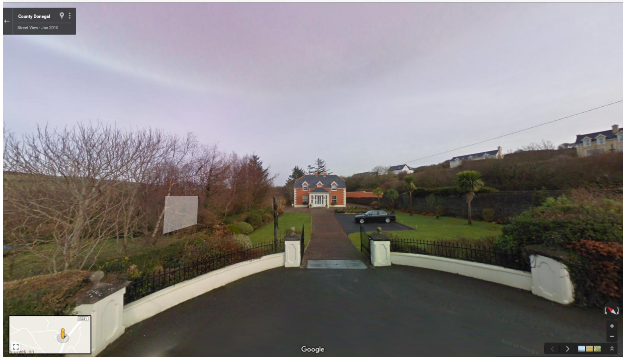
The B&B on the Ardeelan land.